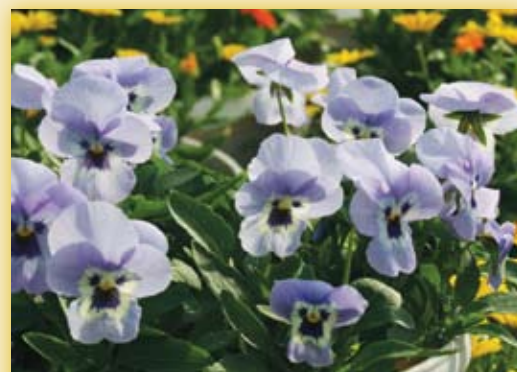
Viola 'Shangri-La Marina' (Tokita Seed Co. Ltd.)

This Flower Award winner offers a unique color; blooms have yellow edges that deepen to a rich apricot in the center. Judges noted the distinct flower color of the 3- to 3½-inch flowers, described as lighter in color than traditional gaillardia. Just 105 days after sowing seed, 'Arizona Apricot' will bloom from early summer into fall. This long-flowering perennial is hardy to Zones 2 through 10 and drought tolerance once established.