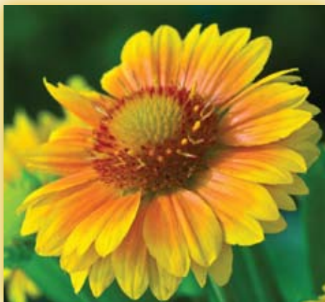
Gaillardia 'Arizona Apricot'

All-America Selections www.all-americaselections.org