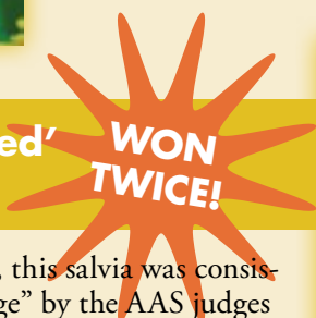
Salvia 'Summer Jewel Red' (Takii & Co.)

Winner of the Bedding Plant category, this salvia was consistently rated "superior" or "above average" by the AAS judges because of its early and abundant flower blossoms that continue from spring to fall. Each dwarf and densely branching plant remains a tidy 20 inches tall, even at maturity. As an added bonus, the bright-red color acts as a magnet for hummingbirds. 'Summer Jewel Red' is ideal for full-sun containers, mixed beds and borders where uniformity is desired.