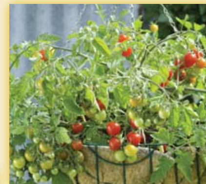
Tomato 'Lizzano' (Pro-Veg Seeds Ltd.)

This Vegetable Award winner is a vigorous semi-determinate tomato with a low-growing, trailing habit, making it ideal for patio containers or hanging baskets. The durable plants grow 16 to 20 inches tall with a compact spread of only 20 inches. Expect generous yields of high-quality, bright-red, cherry-sized fruits.