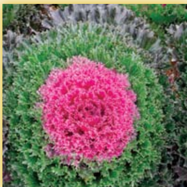
Ornamental Kale 'Glamour Red' (Takii & Co.)

Vegetable Award winner 'Hijinks' produces small-sized, 6- to 7-pound fruits of a very uniform size and shape. It has smooth, deep-orange skin with distinctive grooves giving it a classy appearance for fall decorating. Allow plenty of space in the garden for long vines that spread up to 15 feet.