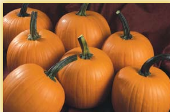
Pumpkin 'Hijinks' (Sakata Seed America)

Vegetable Award winner 'Hijinks' produces small-sized, 6- to 7-pound fruits of a very uniform size and shape. It has smooth, deep-orange skin with distinctive grooves giving it a classy appearance for fall decorating. Allow plenty of space in the garden for long vines that spread up to 15 feet.